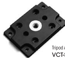
Tripod Adaptor VCT-ST701